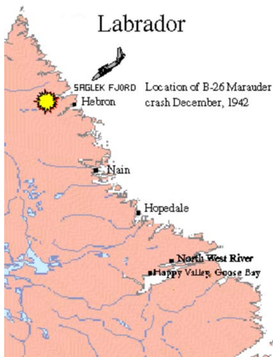
Figure A-4 Crash Site

The weather turned sour and the pilot was forced to crash land at the head of the Saglek Fjord in Labrador. The aircraft sustained minimal damage and the crew survived the impact unscathed. What follows is their efforts to survive in one of the most unfriendly and hostile landscapes on Earth at the worst possible time of year. The diary of the pilot has been retained intact; the last entry added was in February 1943. Except for names and places, spelling and punctuation have been retained as they appeared.