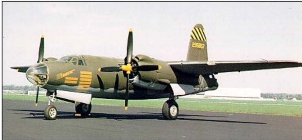
Figure A-2 B-26 Marauder Similar to "Times A Wastin"