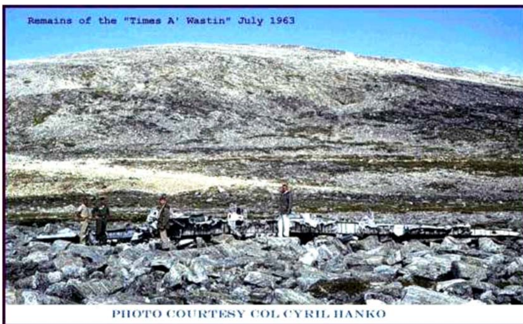
Figure A-1 Remains of the B-26 Marauder "Times A Wastin"

Today, a small United States (US) Airforce converted radar site houses a tropospheric communications link to the northernmost outposts of the hemispheric defence system. From the steep heights, US contractor maintenance personnel overlook the vast stretches of frozen tundra and infrequently visible blue-green of the Atlantic. On a flat stretch of this barren land, at the base of the steep bluff, now crowned by a radome and the concave, billboard antennas of the site, our story finds a setting. No more than 46 m (50 yards) from the present site runway, lie the weathered remains of a B-26 medium bomber of World War II vintage.